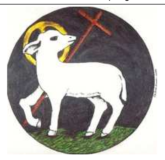
The Paschal Lamb

Apr/May 2015 Lutheran Church Springfield Port Elizabeth - Newsletter No. 2015.2